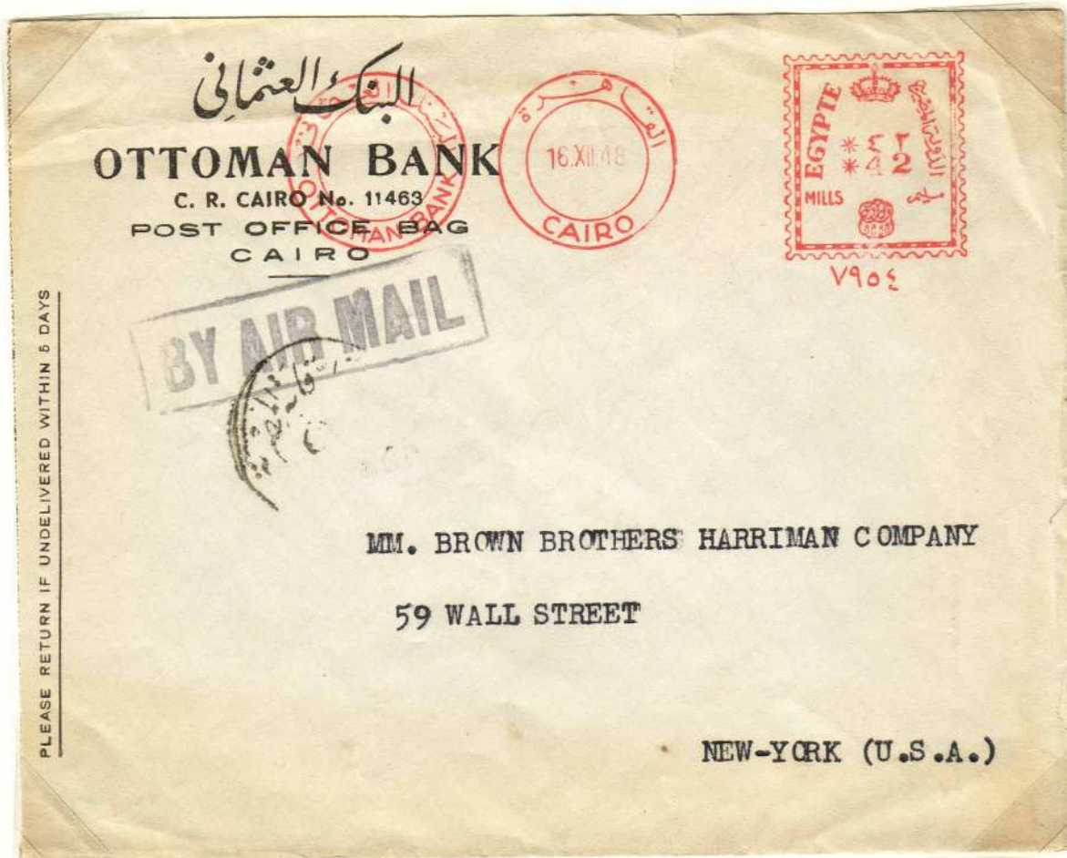
Air mail cover to New York. The franking should have been 57 mills.

16.XII.48 - The earliest reported usage of the Hasler "F88".