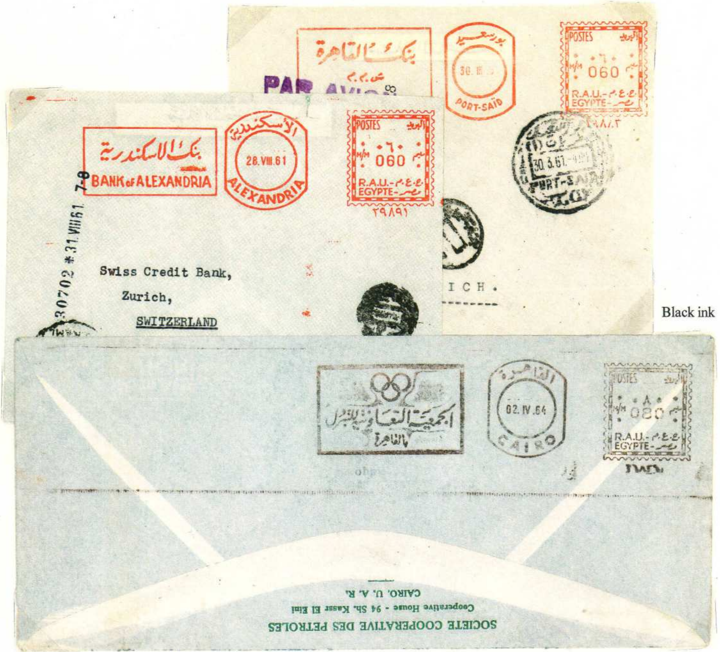
02.IV.64 -- Cairo to London -- 60 mills surface rate from 1 Sept 63 + 20 mills air mail surcharge from 1964

The size of the townmark varied with the length of the city name.