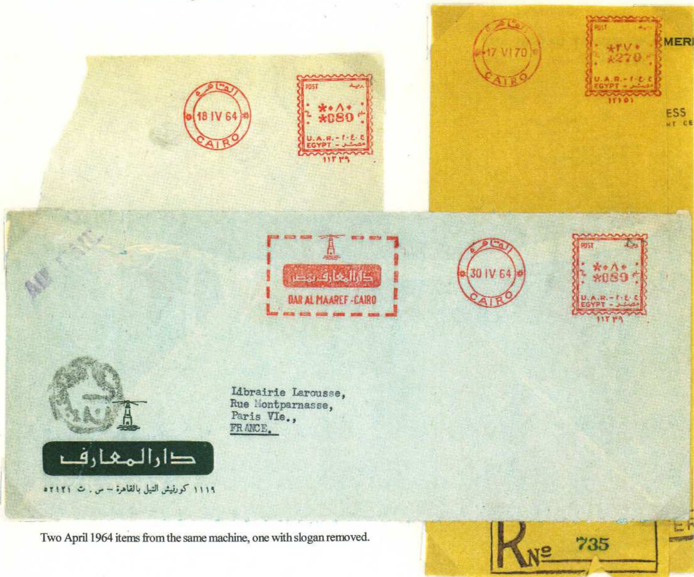
Two April 1964 items from the same machine, one with slogan removed.

In the actual exhibit, this page is 11" x 11".