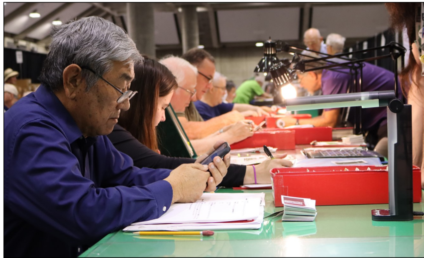
AMERICAN PHILATELIC SOCIETY

The show is sponsored by the American Philatelic Society, the