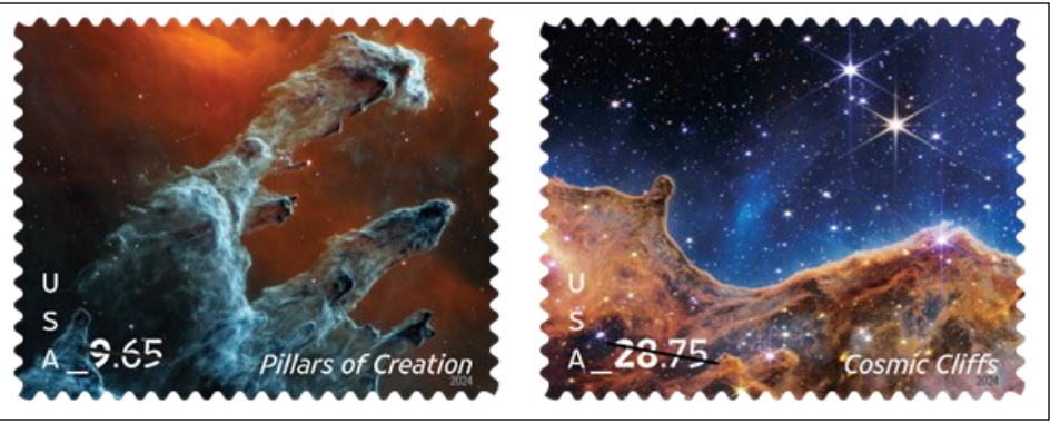
U.S. POSTAL SERVICE

The stamps being issued in January for both services are striking. They show images from the James