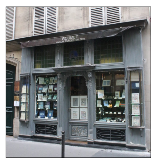
Roumet SA, founded in 1896, is one of oldest stamp shops in Paris. The firm has occupied the same building on Rue Drouot since 1927.

Roumet SA is one of the oldest shops on the street. Founded in 1896, four generations of the Roumet family have catered to stamp collectors looking for fine and difficult-to-find material. The firm sells solely through mail auctions today, but welcomes collectors to view its offerings in person.