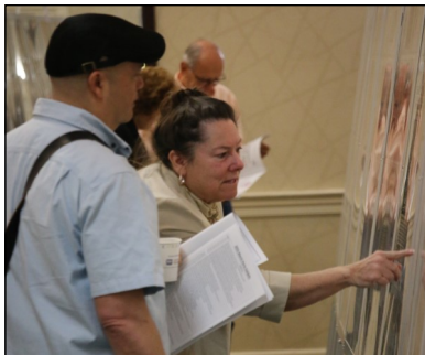
March Party visitors view one of the 35 exhibits on display.

Frolich's exhibit is eligible to enter the annual Champion of Champions competition during the Great American Stamp Show 2024, set for Aug. 14-17 at the Renaissance Schaumburg Convention Center in Schaumburg, Illinois.