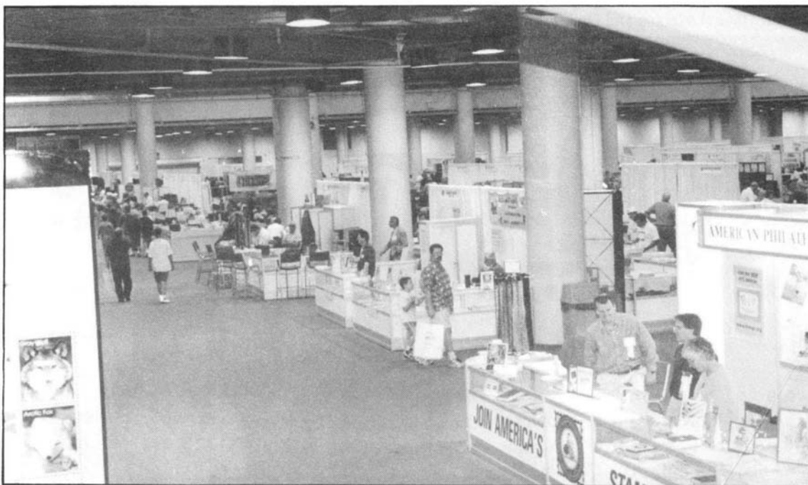
Panoramic view of exhibition floor along the main aisle leading to the west end of the hall. The American Philatelic Society booth is at lower right. In all, there were nearly 200 booths, including dealers, societies and the philatelic media.