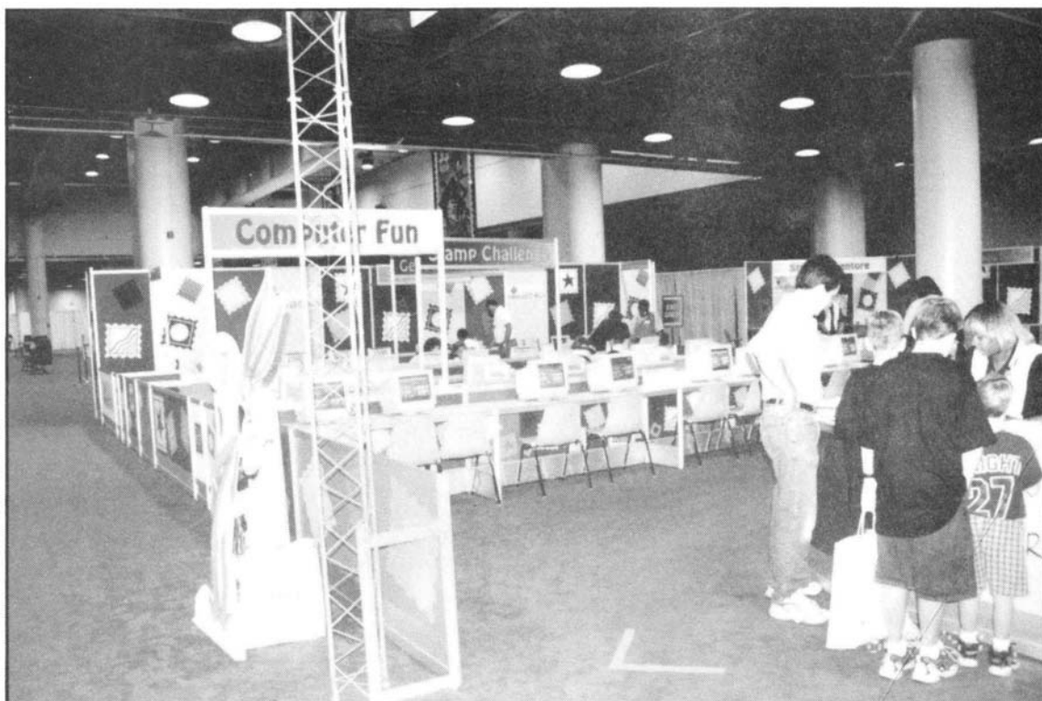
A view of the very elaborate youth area set up by the U.S. Postal Service, complete with computer games, puzzles and other challenges for the youngsters.