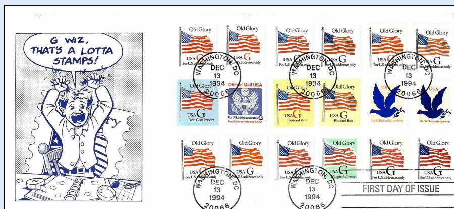
A first day cover of the many "G" nondenominated (32 cents) stamps postmarked in the nation's capital on Dec. 13, 1994.