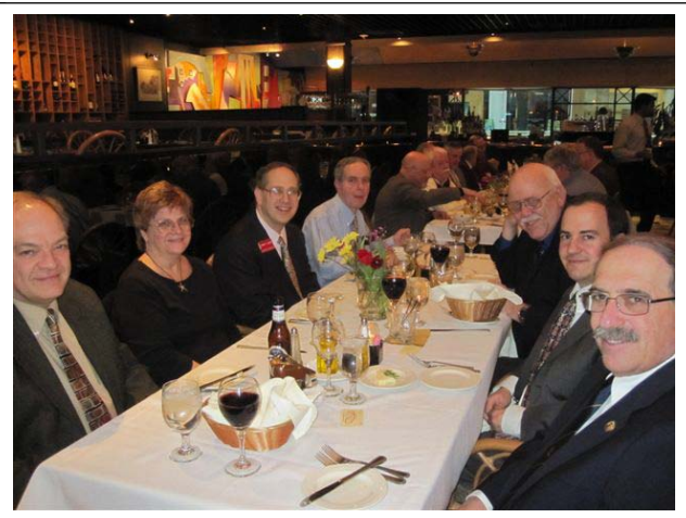
And a Good Time Was Had By All!